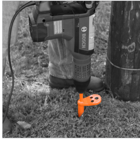
Fits 1/2", 5/8" and 3/4"