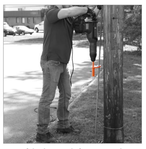
Safely drive rods from ground