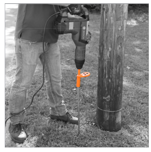
Tool locks into hammer drill