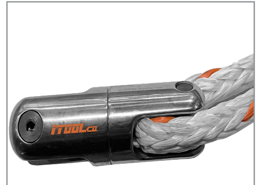
Protects pulling eye