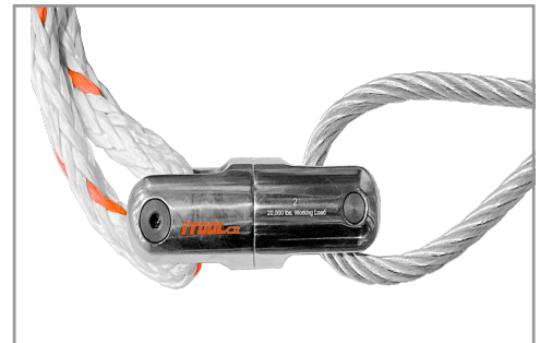
Quick install between pulling eye and pulling swivel

Take the guesswork out of connecting pulling eyes and rope using iTOOLco's Pulling Swivels. Quality tested to ensure optimum performance and reliability, iTOOLco Pulling Swivels combine a high safe working load with a compact, heavy-duty design. By uniformly distributing the load, iTOOLco Pulling Swivels reduce wear on the rope pulling eye. Two pins provide a quick and secure connection between the rope and wire. Cable and rope swivel independently, reducing tangling of rope and cable during pulls. iTOOLco Pulling Swivels are available in three convenient sizes.