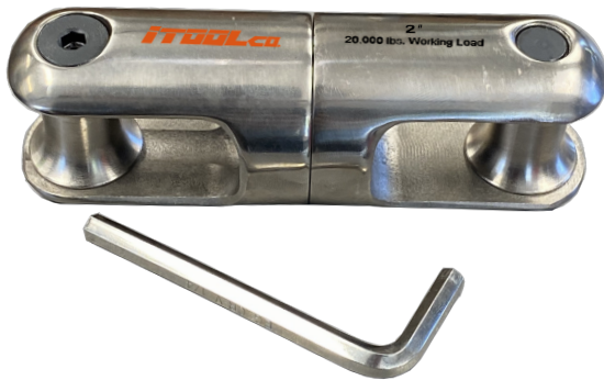
SW-200 20,000 lb. 2"