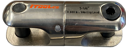
SW-114 6,000 lb. 1-1/4"