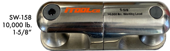
SW-158 10,000 lb. 1-5/8"